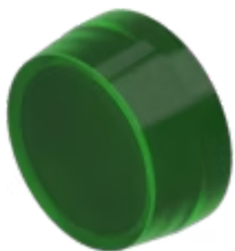
704.603.5 Lens cap