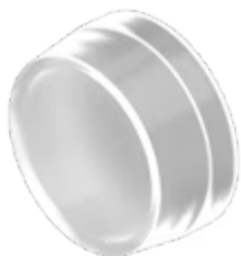
704.603.7 Lens cap